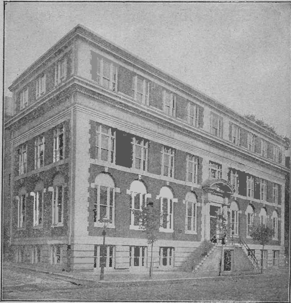
NEW DENTAL AND PHARMACEUTICAL BUILDING OF THE UNIVERSITY OF MARYLAND