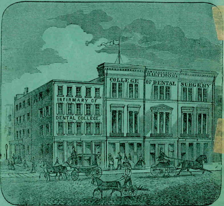
N. E. CORNER OF LOMBARD & HANOVER STREETS.