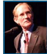
Dr. Peter Agre, the keynote speaker

BioHealth Innovation (BHI), presented various topics ranging from personalizing oncology to developing a test panel for the detection of gene mutations. This symposium was co-organized by the Division of Molecular Pathology, the Program in Personalized Medicine and Genomic Medicine, the Translational Genomics Laboratory at UMSOM, and the Chinese Biopharmaceutical Association (CBA-USA).