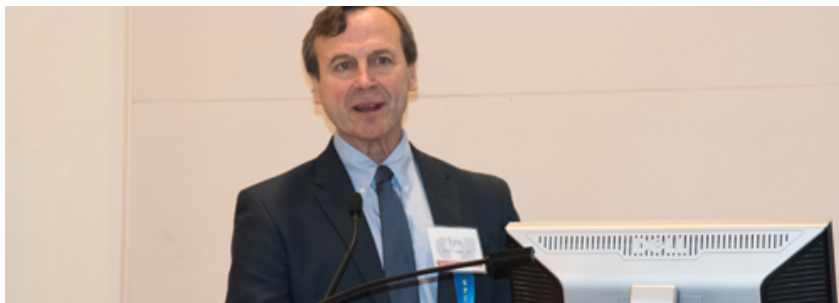
Opioid Addiction Epidemic: 'An Everywhere Problem'