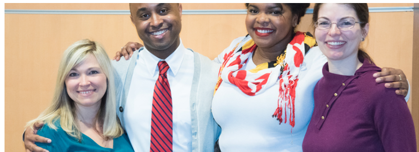
UMB Offers Employees New Homebuyer Incentive