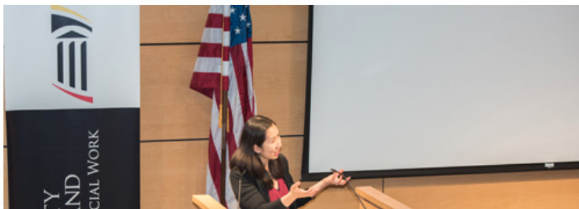
Wen to Social Workers: Addiction Stigma Must End