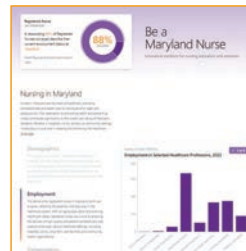
This work was supported by a Nurse Support II (NSP II) grant from the Maryland Higher Education Commission under the auspices of the Health Services Cost Review Commission.