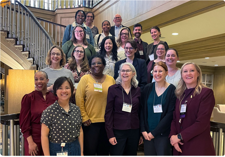
HSHSL employees attended the MACMLA meeting in Oct. 2025.