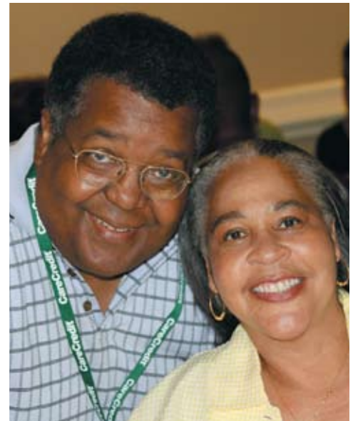
▶▶ The Thomas P. Hinman Dental Meeting • March 26, 2010, Atlanta, Georgia