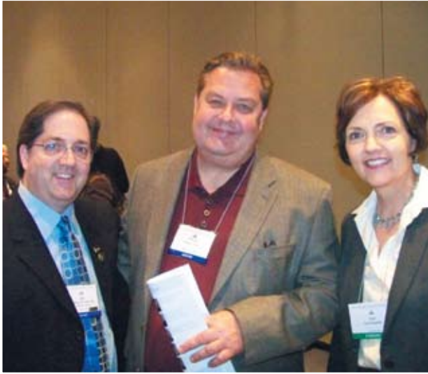
Nation's Capital Dental Meeting • ◀ April 9, 2010, Washington, D.C.