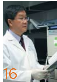
Bridging the Gap