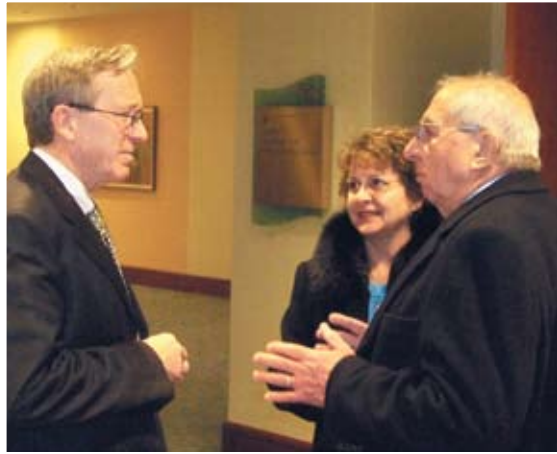
Yankee Dental Congress • January 29, 2010, Boston, Massachusetts ▲