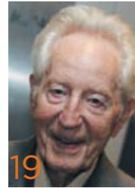
The Conscience of Dentistry