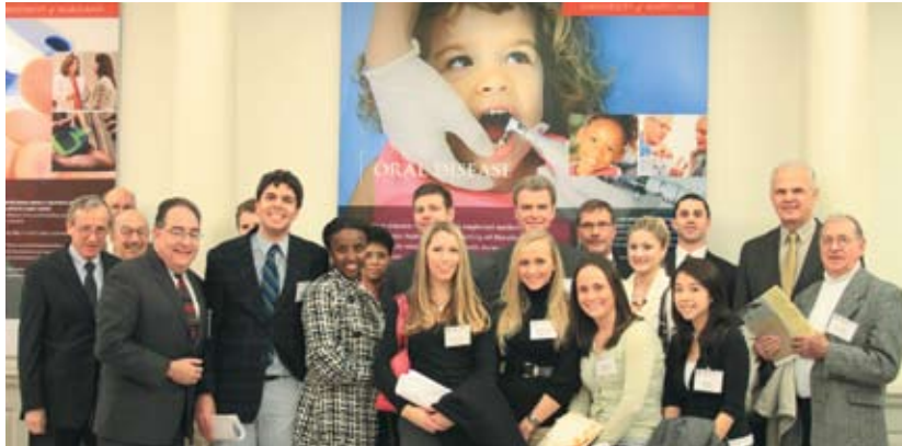
The University of Maryland School of Dentistry Advocacy Day delegation