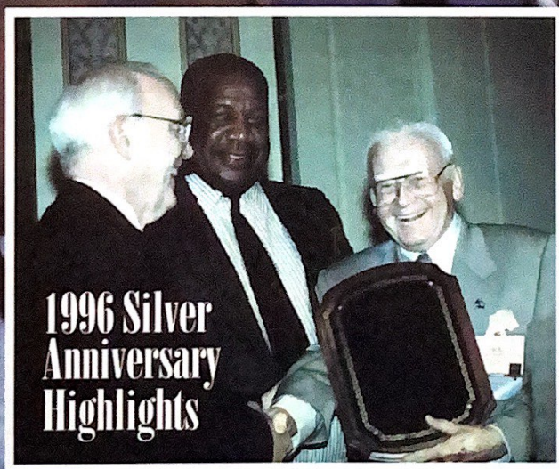
1996 Silver Anniversary Highlights