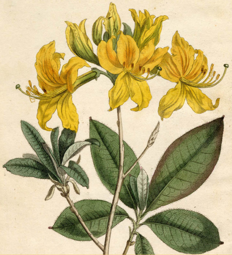
From the Pharmacy Historical Collection at the HSHSL: Curtis, William. The Botanical Magazine or Flower-Garden Displayed. Vol. 13. 1799. Plate No. 433.

The 2023 HSHSL Calendar, "Fatal Beauty," featured a selection of stunning botanical plates from volumes in the HSHSL's Historical Pharmacy Collection. The calendar showcased botanicals that, if used improperly, can be deadly.