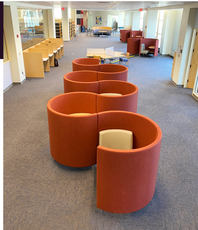
Third Floor Study Space

After purchasing more than 1,000 digitized older journals over several years, the HSHSL was able to remove 34,000 print volumes. This provided the opportunity to design additional study space. The project involved removing print journals, shifting the collection, pulling up shelving, and installing carpeting. The project team made sure to get student input on furniture preferences before designing the layout. The new study area includes individual study pods, diner-style banquettes, computer tables with monitors, and new tables in the study rooms. The new area is light-filled and comfortable – a destination study space for students.