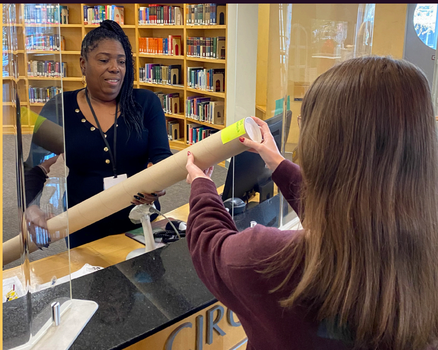
A member of the Information Services team hands a poster to a student.

A convenient service supporting conference presentations