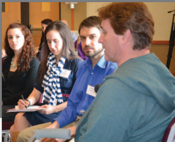
▼ Standardized patient (right) and IPE participants.