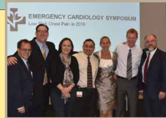
Emergency Cardiology Symposium

On April 1, a free Livestream, open-access Emergency Cardiology Symposium was presented by the Department of Emergency Medicine