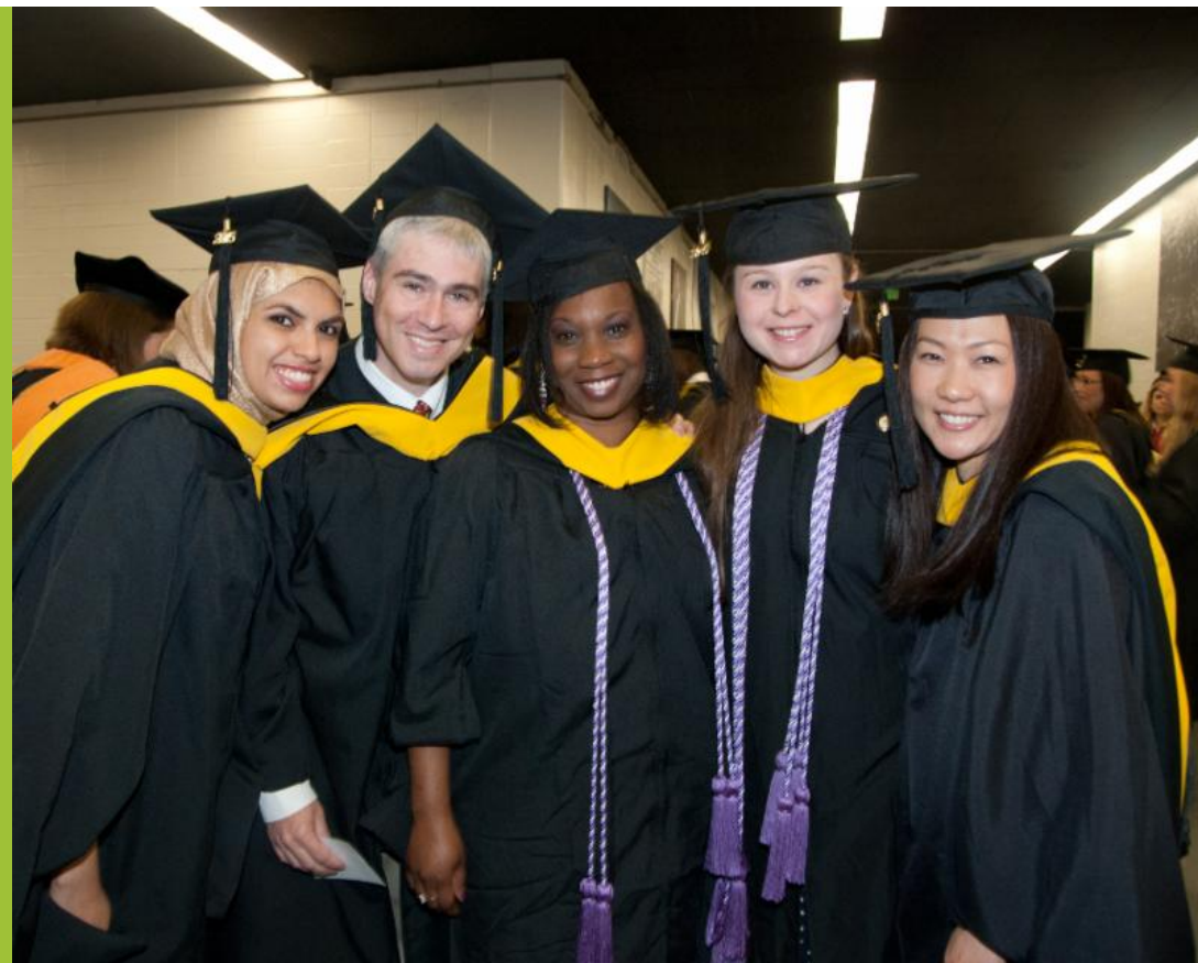
Three hundred forty-four UMSON graduates received degrees at the 2015 Convocation ceremony, held May 15 at Royal Farms Arena. Click here to read more and view the photo gallery.