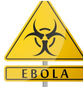
Leadership During a Public Health Emergency: Ebola March 15