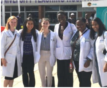
Ethical Global Engagement: The Problem with Voluntourism November 8