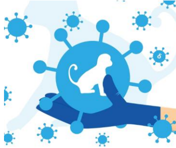
Leadership During a Public Health Emergency: Monkeypox November 17