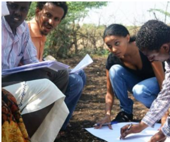
Working with Interpreters February 7