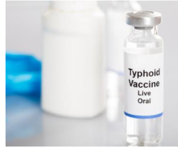
Leadership During a Public Health Emergency: Typhoid January 18