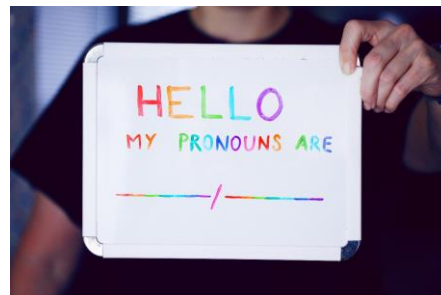
Inclusive Pronouns Training