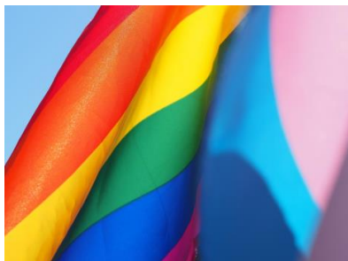
Safe Space Training Part I

The Pride month events listed below are a collaborative effort from the Intercultural Center, the Office of Equity, Diversity, and Inclusion, and Stonewall Pride, the LGBTQ+ staff and faculty affinity group.