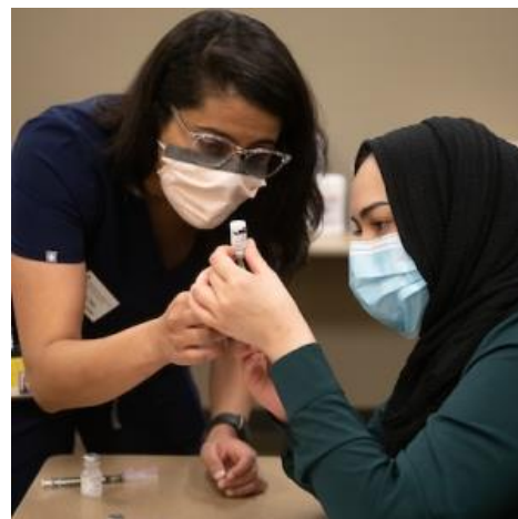
PPE Available at UMB

The Office of Emergency Management (OEM) Critical