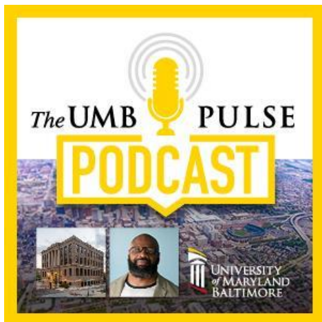
The UMB Pulse: Episode 2