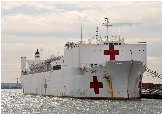
USNS Comfort docked in Baltimore, 2010.