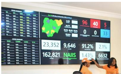
The Activity Information Management System (AIMS) dashboard pictured above was developed by Ciheb to facilitate real-time monitoring of survey implementation. It was first used in the 2018 Nigeria HIV/AIDS Indicator and Impact Survey (NAIIS).